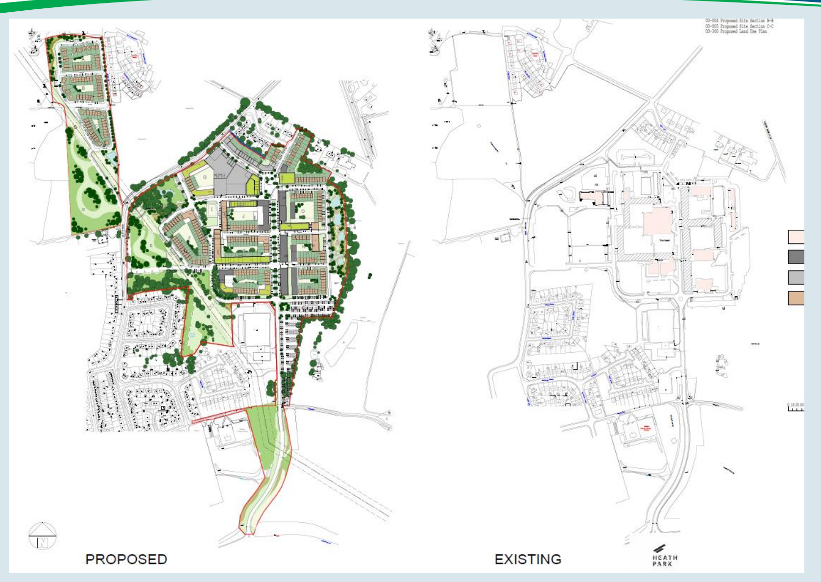
Application Number: 22/00569/OUT