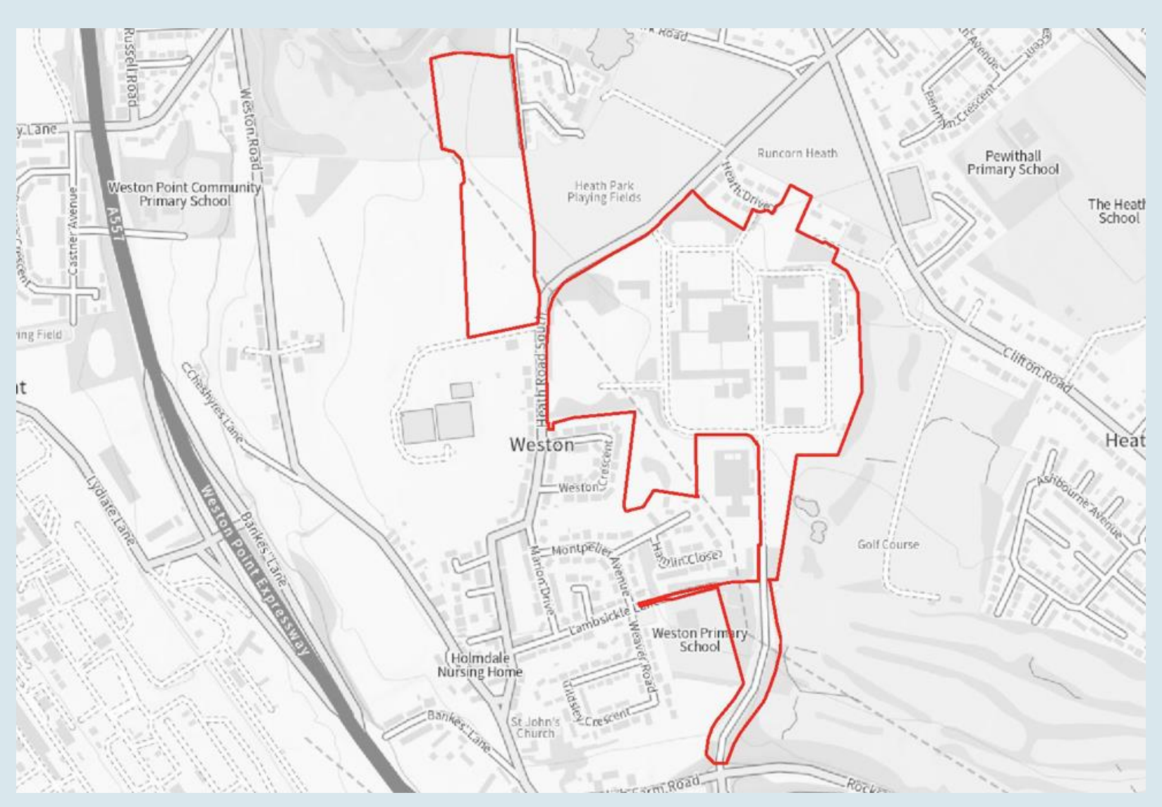
Application Number: 22/00569/OUT