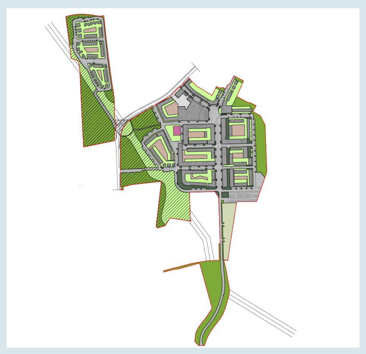
Plan IE: Proposed Green Infrastructure & Greenspace