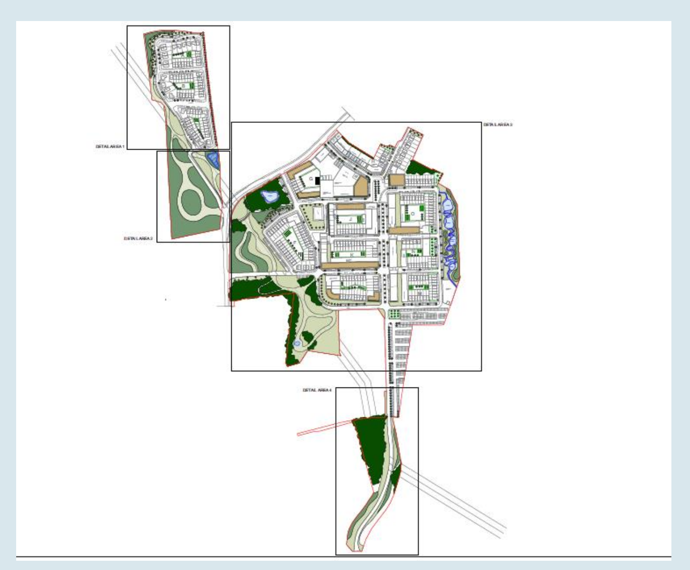
Application Number: 22/00569/OUT