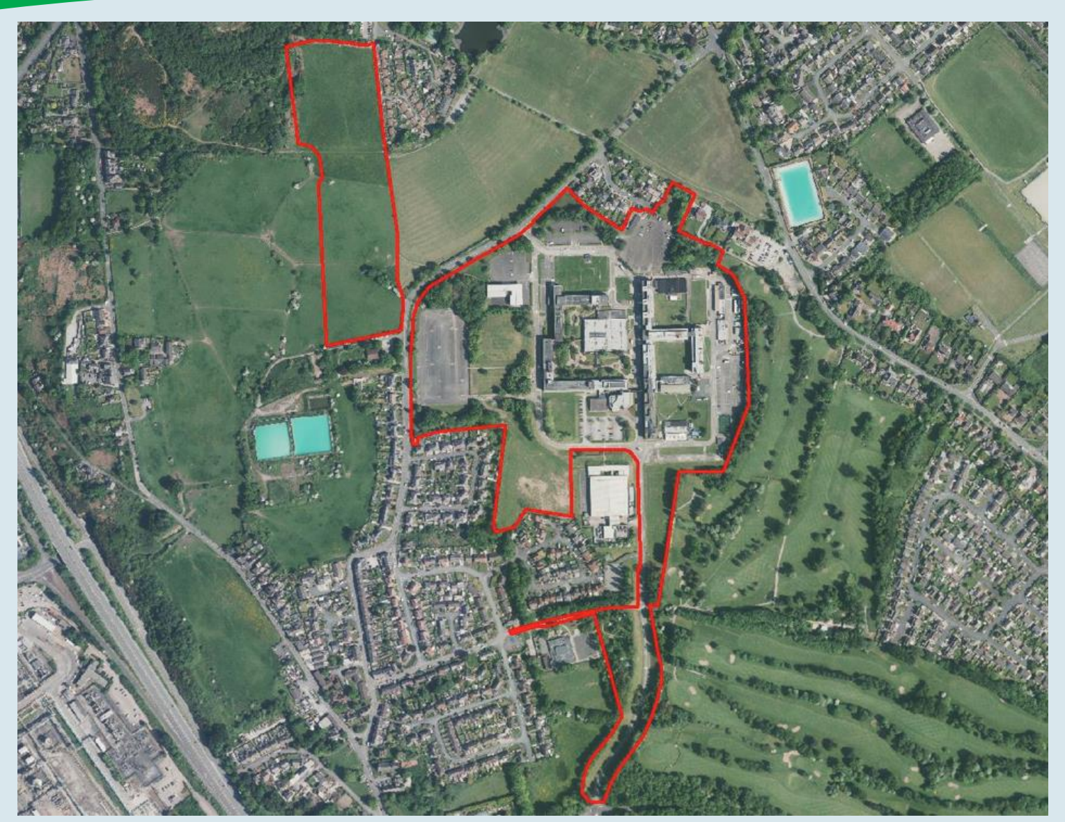
Application Number: 22/00569/OUT