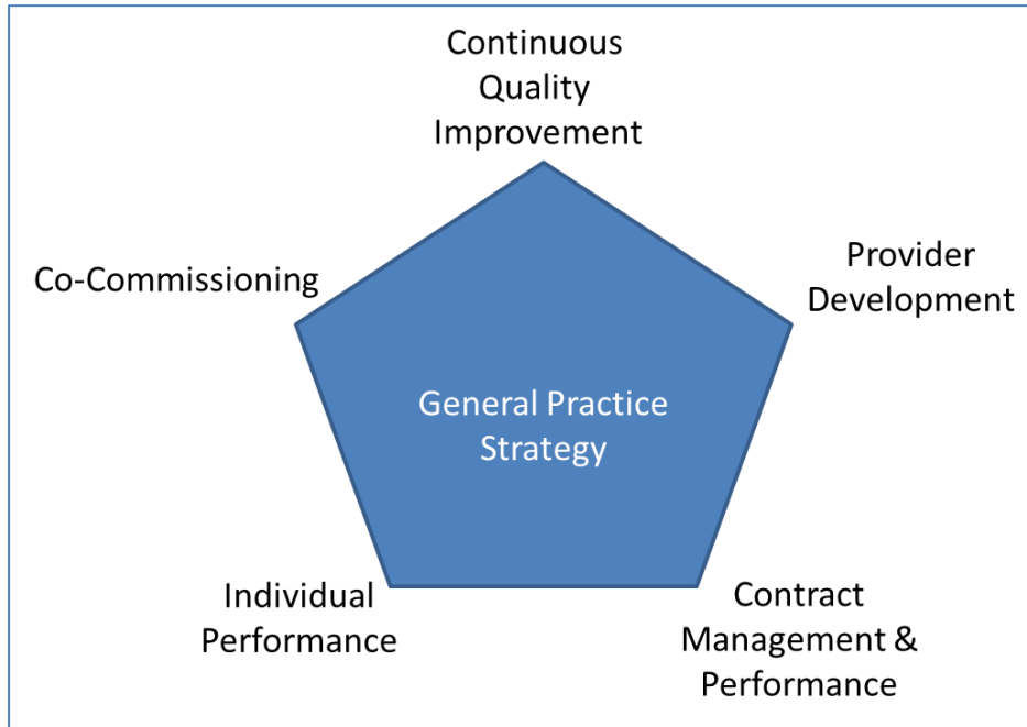
Figure Four: NHS Halton approach to co-commissioning

To support the development and implementation of this strategy, including successfully delegated co-commissioning status from NHS England, we have identified five key elements involved in the commissioning and contracting of General Practice: