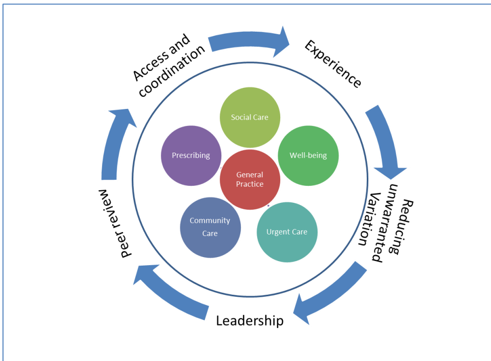
Figure Three: Integrated health and delivery model

Our future model of care will be established with services being centred around people in the community. Delivery may be across the whole CCG on a Halton-wide footprint; by bringing more than one GP practice together to service distinct communities through a ‘hub’ based approach; by sustaining individual practices wherever appropriate and by giving local people and communities more opportunities to self-care and create resilience. The constant in the model is to ensure that everyone’s needs are met through an integrated health and care delivery model. Integration will involve practices working together with acute care, community and mental health providers as well as social care, the voluntary and community sector and a host of other organisations and individuals, as described in the diagram below.