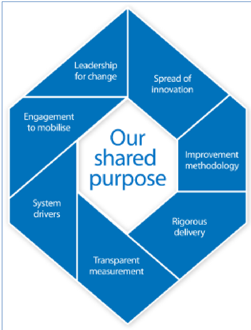
Figure Two: NHS Change Model

The underlying approach in developing the strategy has been based on the stages described within the NHS Change Model 5 .