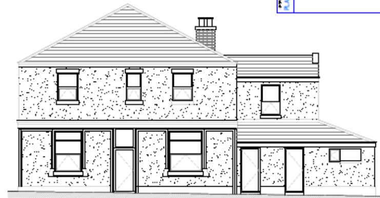
EXISTING SIDE ELEVATION | SCALE 1:50