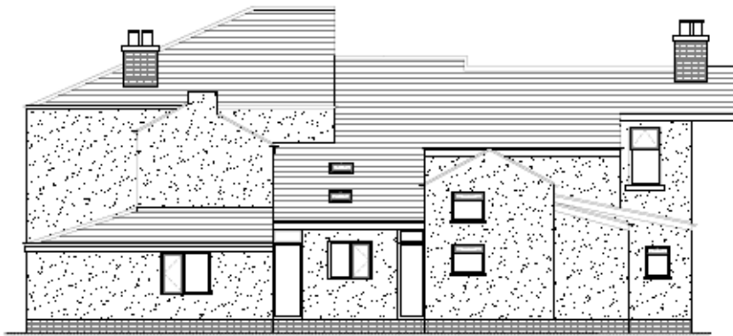
EXISTING REAR ELEVATION | SCALE 1:50