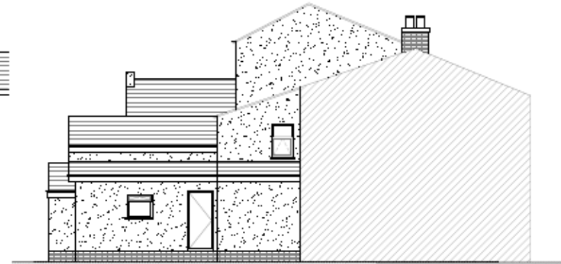
EXISTING SIDE ELEVATION | SCALE 1:50