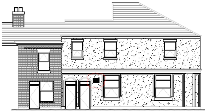
EXISTING FRONT ELEVATION | SCALE 1:50