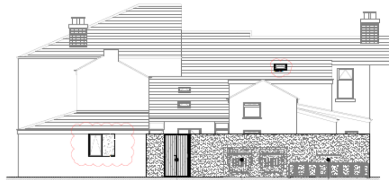
PROPOSED REAR ELEVATION | SCALE 1:50

New secure double gates added to existing opening within existing rear boundary wall, providing direct access into the rear yard for waste removal and cycle rack