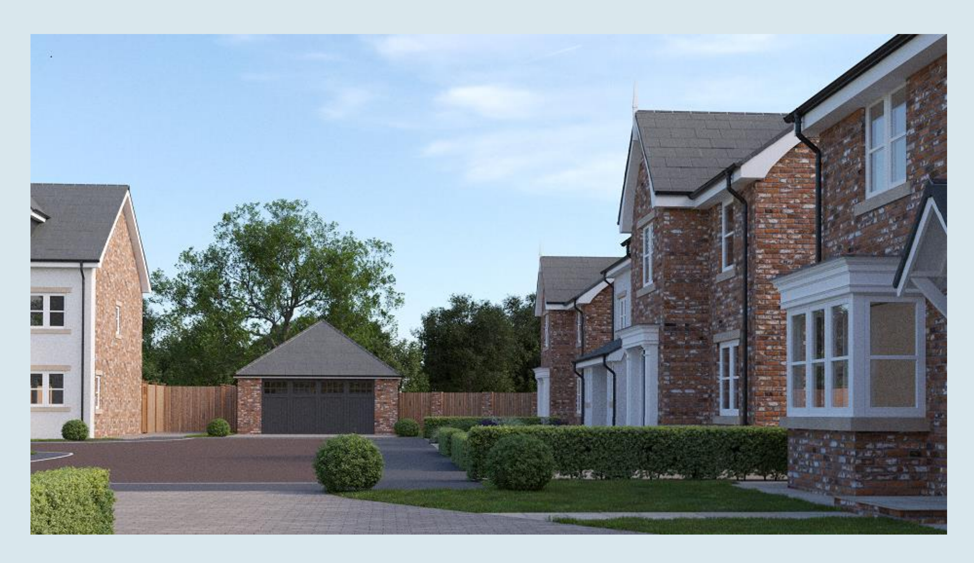
Application Number: 22/00638/FUL