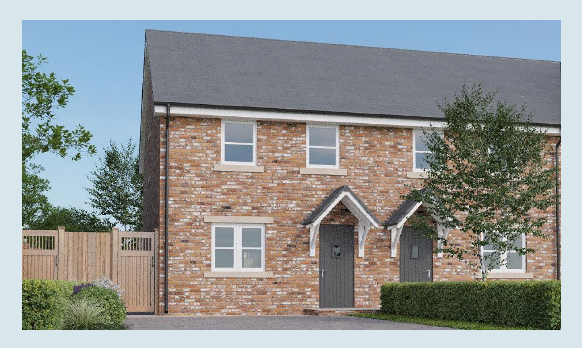
Application Number: 22/00638/FUL