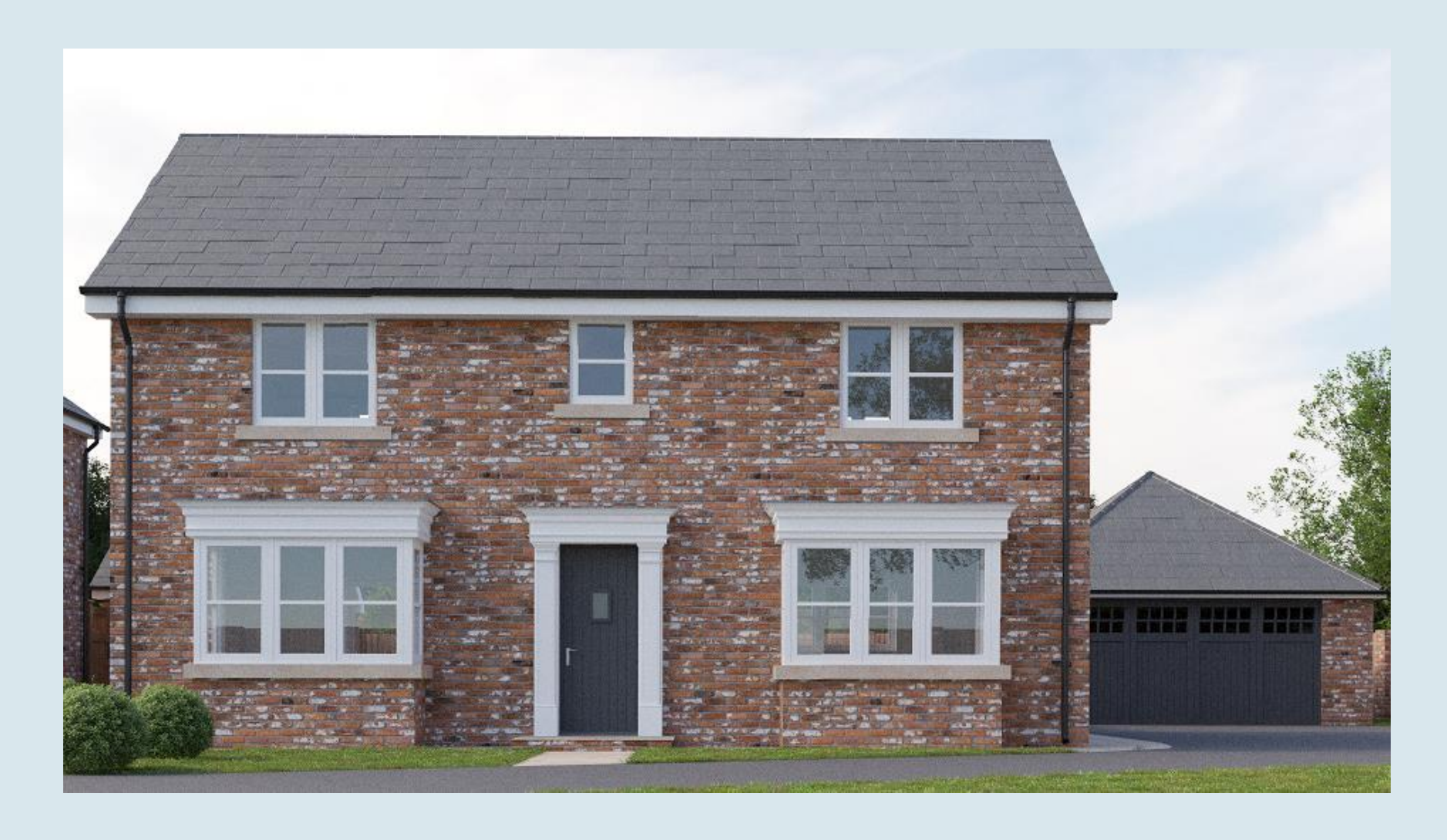
Application Number: 22/00638/FUL