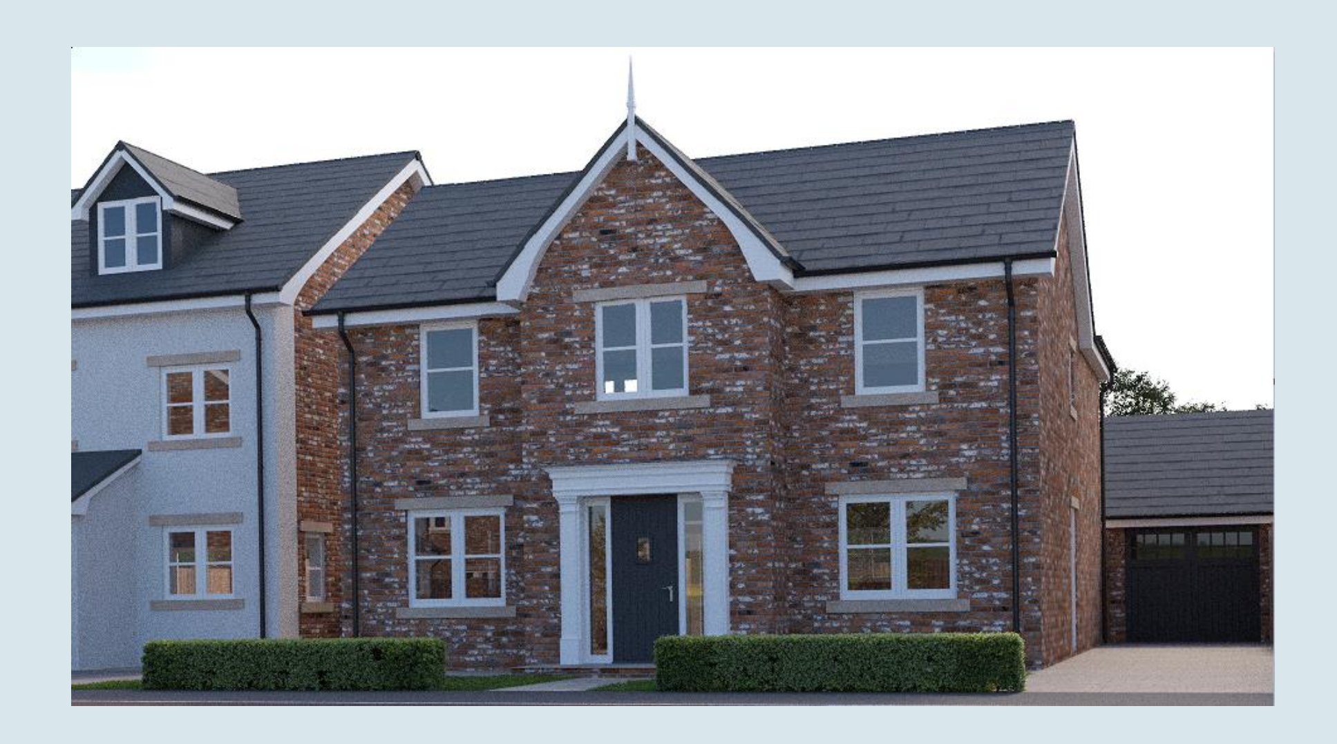
Application Number: 22/00638/FUL