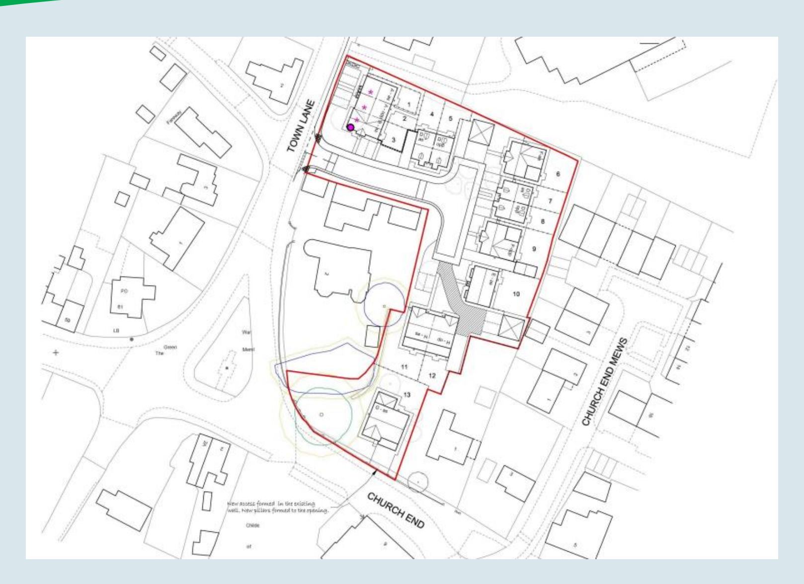
Plan IB: Layout Plan