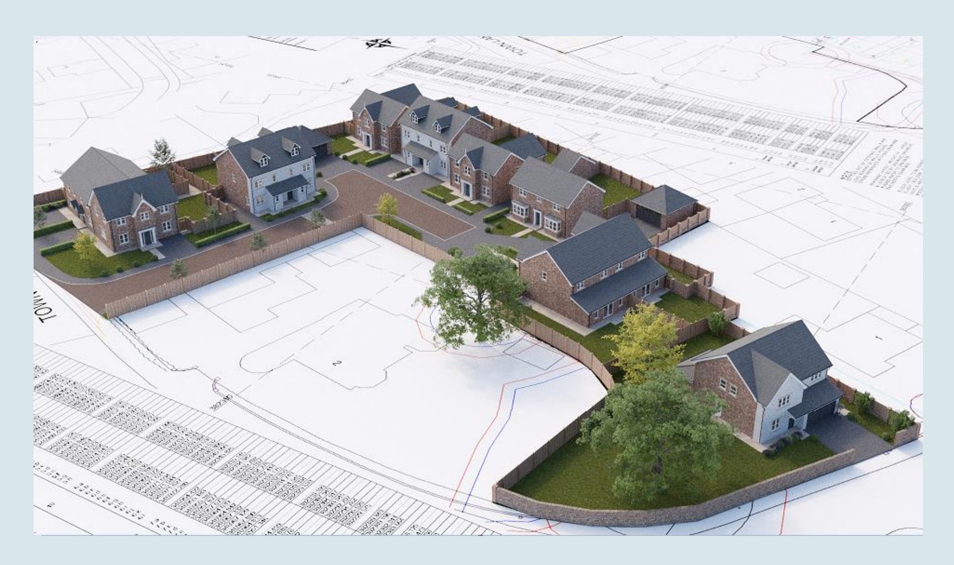
Application Number: 22/00638/FUL