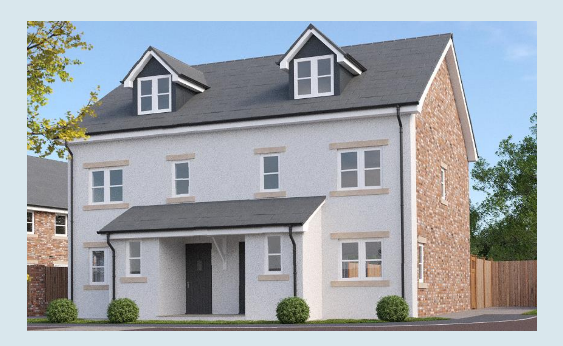
Plan IE: House Type D