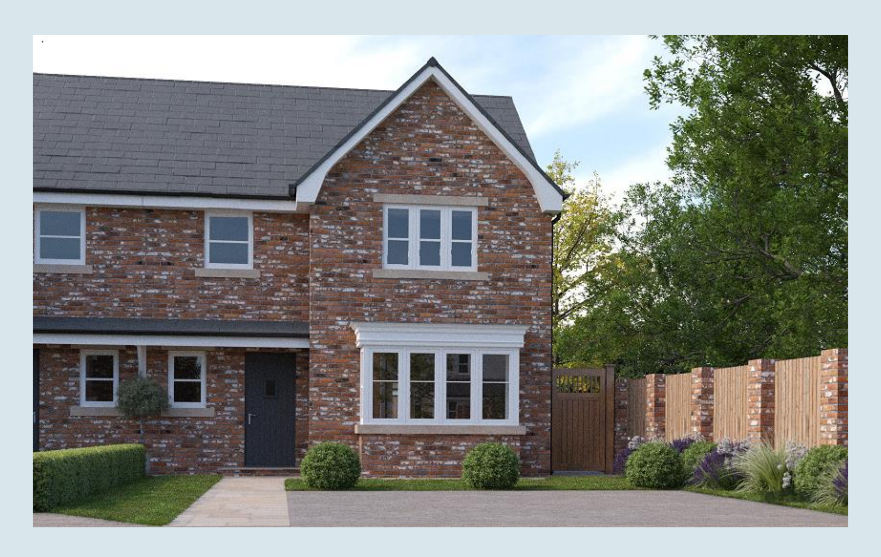
Plan II: House Type H