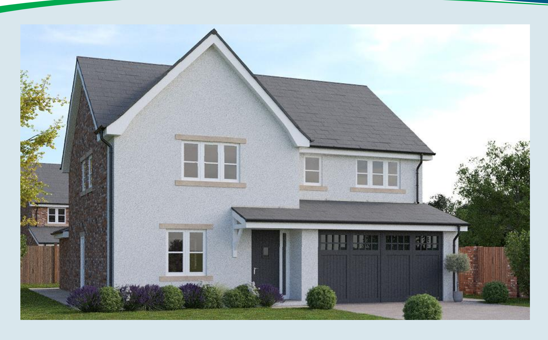
Application Number: 22/00638/FUL