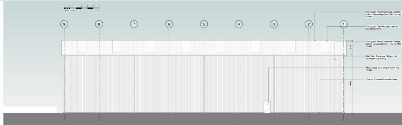
1 Elevation_01 1 : 100